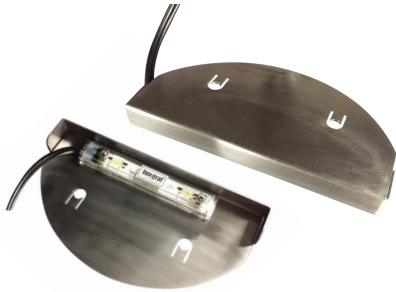
Model IL600.150.500 6.0" width x .5" height x 3.0" depth Includes a single 2.0 watt LED module