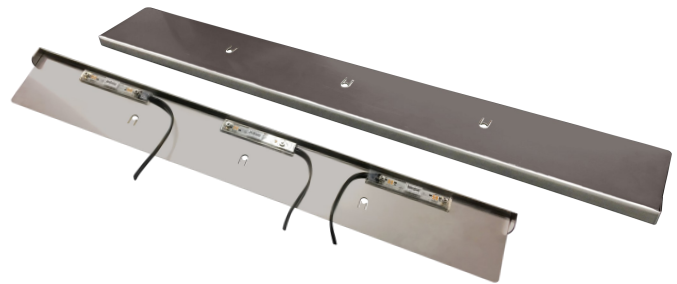
Model IL624.150.500 24.0" width x .5" height x 3.0" depth Includes three 2.0 watt LED modules