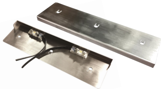
Model IL612.150.500 12.0" width x .5" height x 3.0" depth Includes two 1.0 watt LED modules