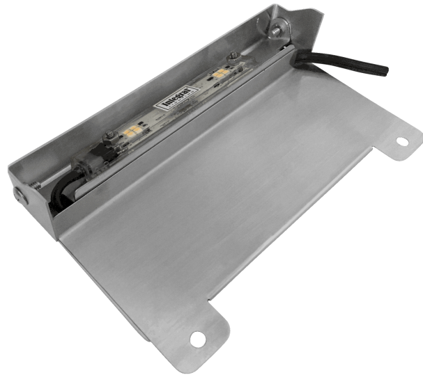
IL6000.150.500 Stainless Steel finish shown with Thinsert® sleeve for easy extraction and reinsertion after installation