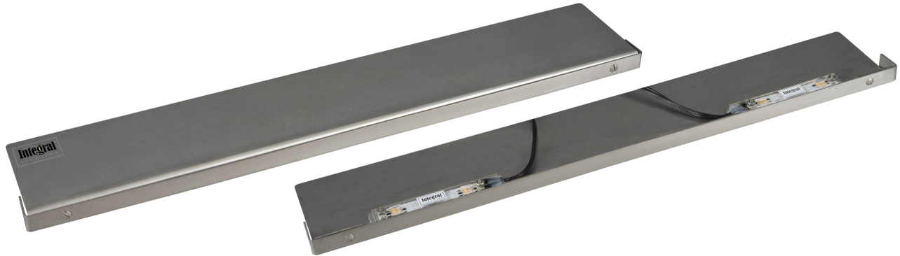
IL18.250.500 Clay finish shown