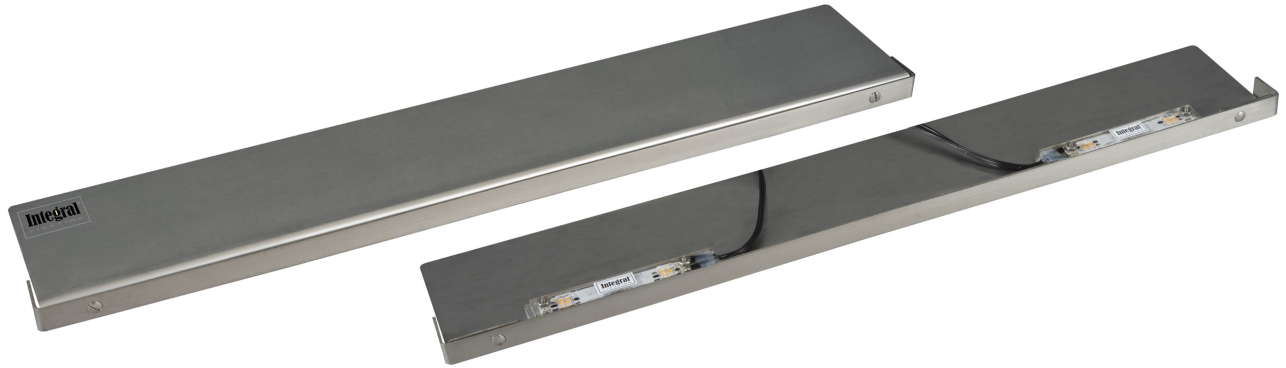
IL18.250.500 Clay finish shown