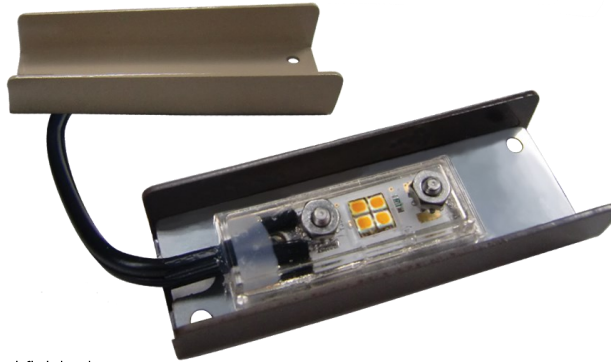
DL3.375.500 Sand finish shown